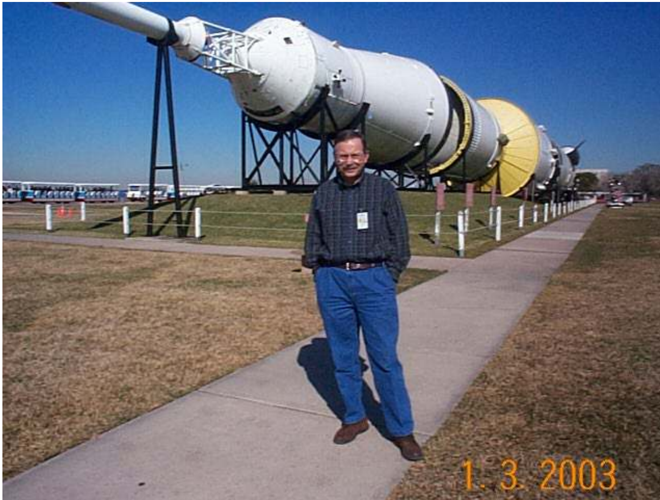
Last Day at NASA/JSC on January 3, 2003