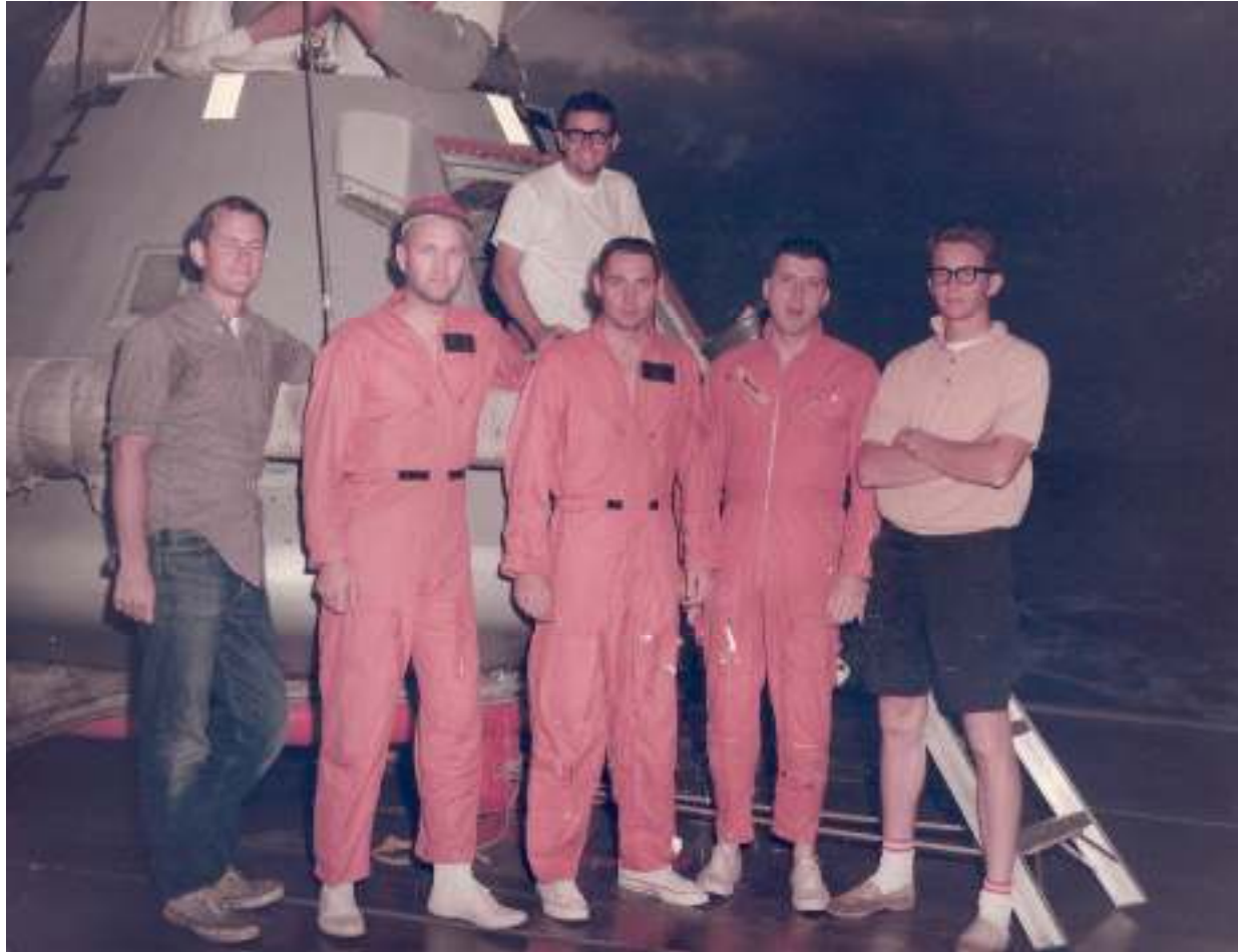
CM-007 and test crew following Block I 48-hour manned postlanding systems qualification test in Gulf of Mexico on September 30-October 2, 1966