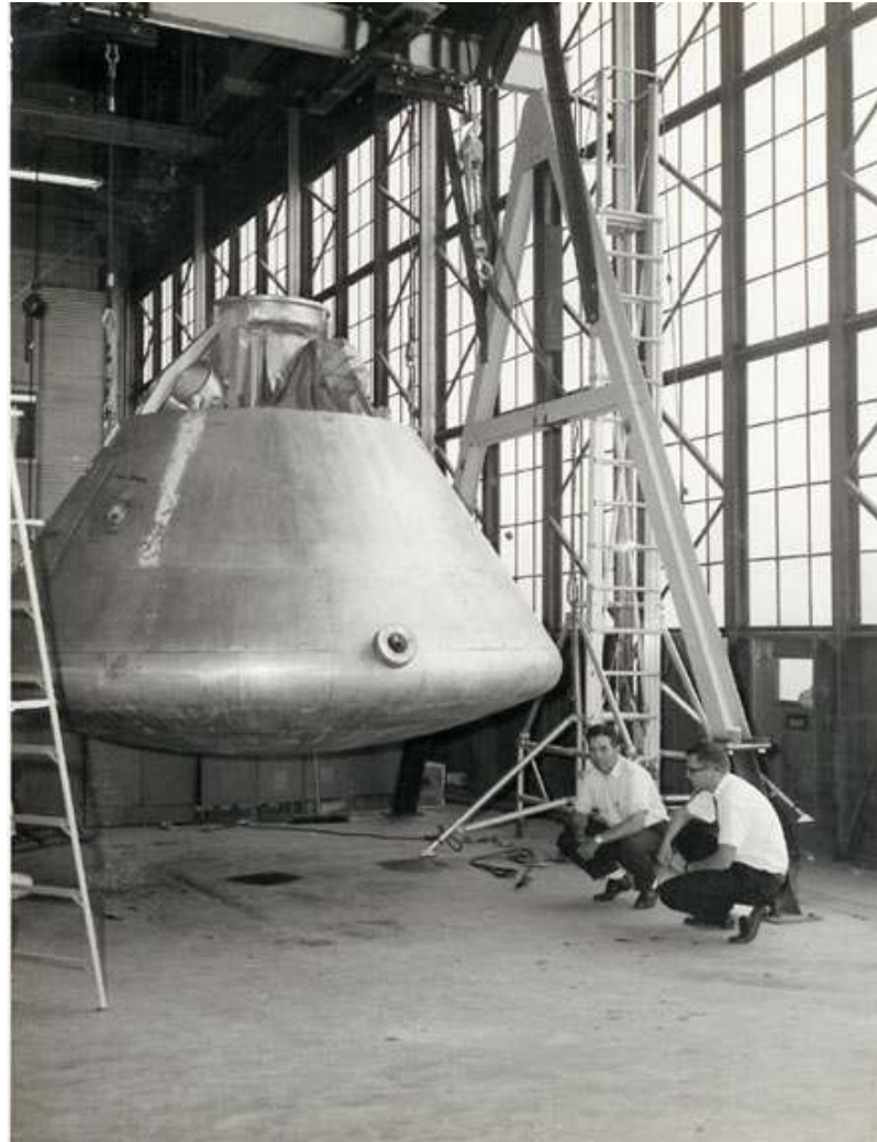
BP-1101 Initial Weight & CG at Ellington AFB Hangar-135 in April 1965