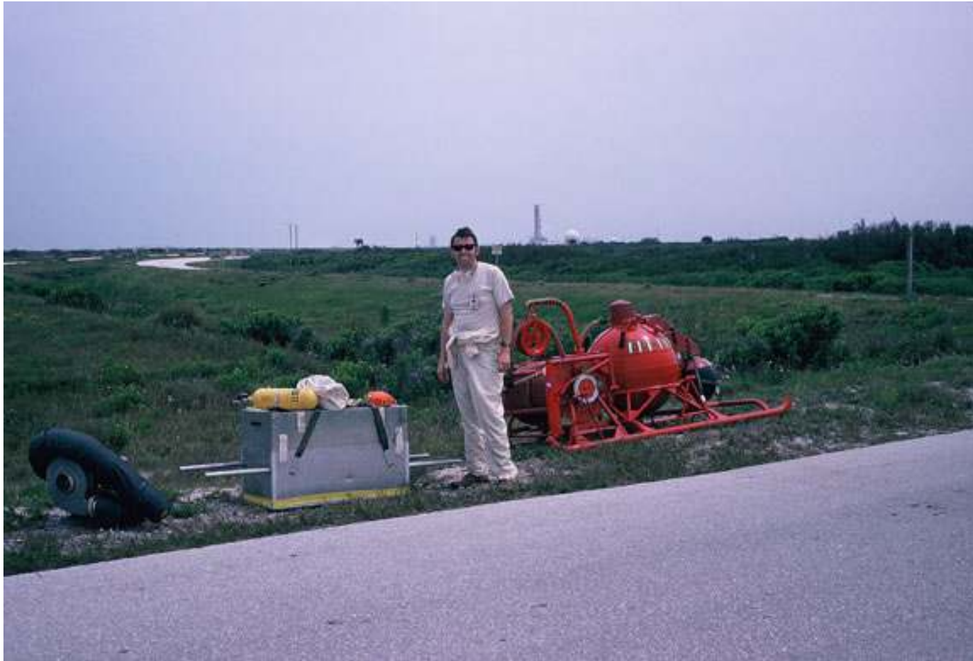
Prime Jammed Hatch Kit and fire suppression unit on station at KSC for Apollo 13 launch on April 11, 1970