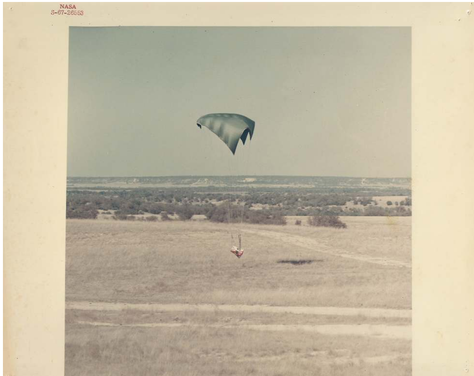
Figure 7: LOTV Landing