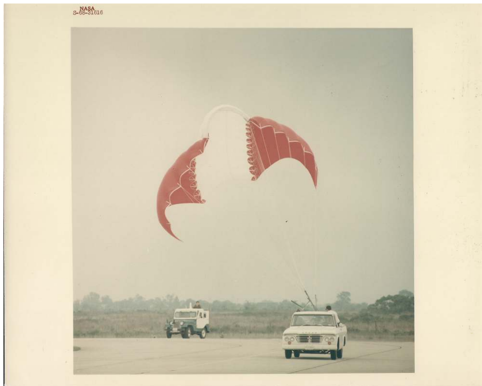
Figure 8: Snowball-1 and Snowball-2