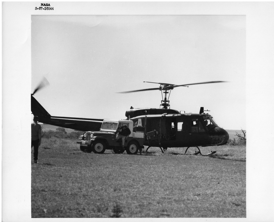
Figure 3: Helicopter and Snowball-2