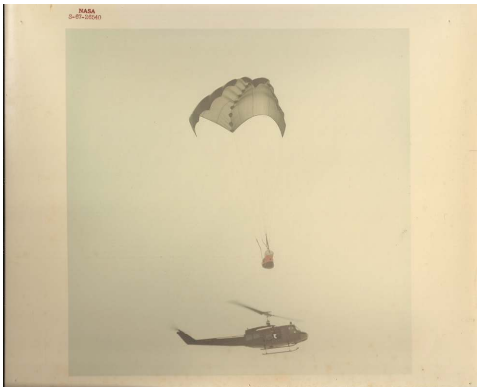
Figure 6: LOTV and Sailwing