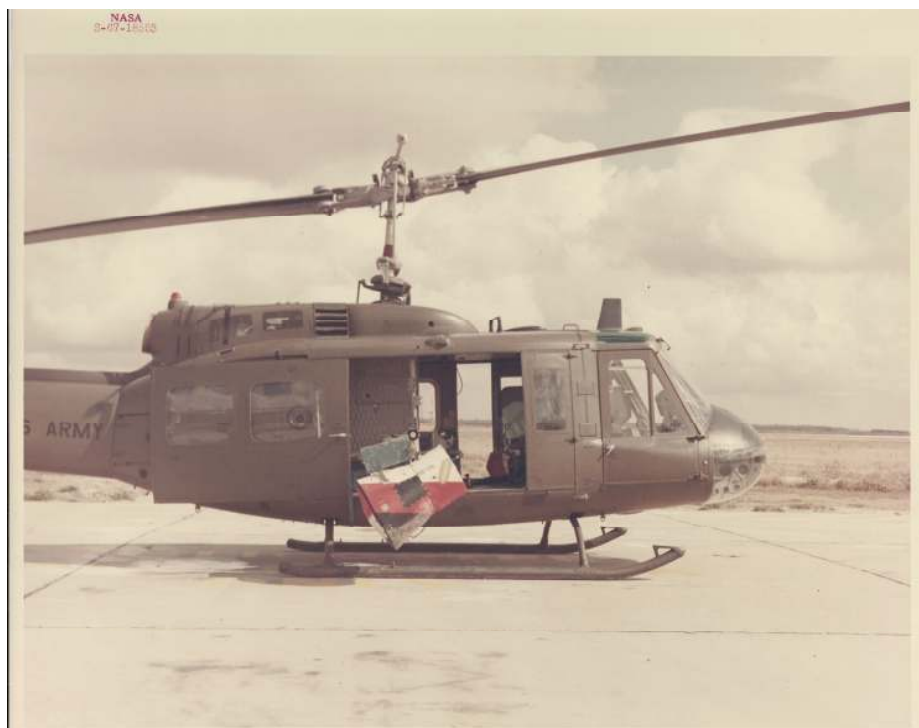
Figure 2: LOTV and UH-1 Helicopter