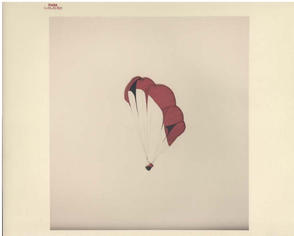
Figure 5: Sailwing