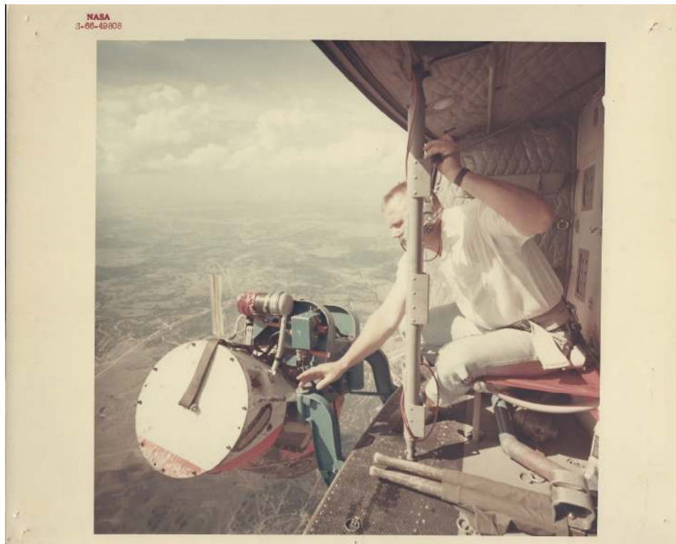
Figure 4: LOTV Just Before Drop